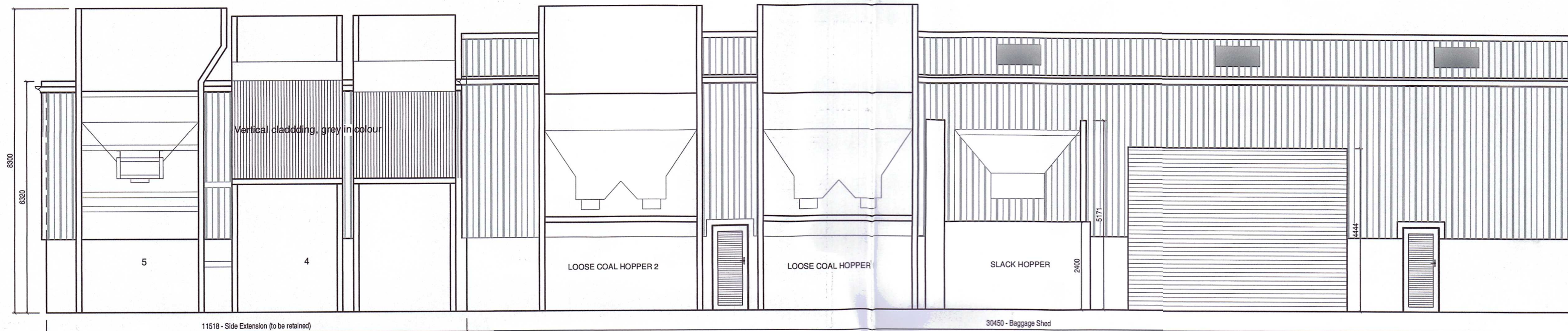
Rear Elevation Facing North